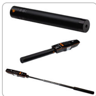
WaveStick Part # WWMA0002

Adjustable extension stick (73 cm / 28,74 ")