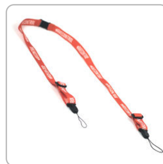
WaveMon Lanyard Part # WWMA0003