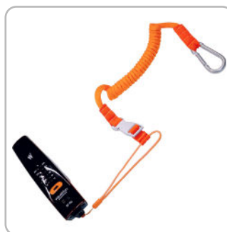
Safety cable Part # WWMA0001

Adjustable extension stick (73 cm / 28,74 ")